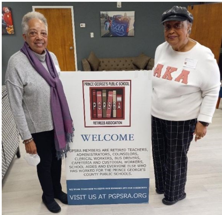
Door Prize Winners